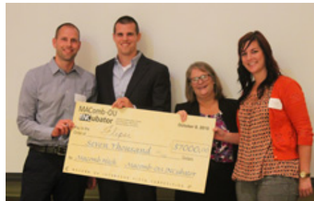
Flipsi with their first place winnings